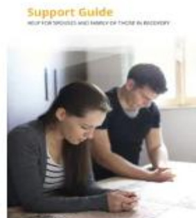
Support Guide HELP FOR SPOUSES AND FAMILY OF THOSE IN RECOVERY

Spouse and Family Support Group Meets Weekly on Zoom Tuesdays at 8:00 pm