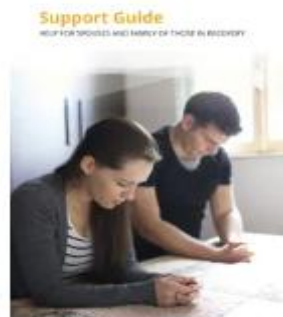
Support Guide HELP FOR SPOUSES AND FAMILY OF THOSE IN RECOVERY

Spouse and Family Support Group Meets Weekly on Zoom Tuesdays at 8:00 pm