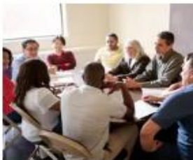
Healing through the Savior THE ADDICTION RECOVERY PROGRAM 12-Step Recovery Guide

Recovery Meetings Meet Weekly on Zoom Sundays at 3:00 pm