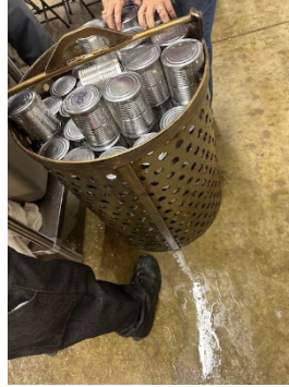
Cans fresh off the cooker