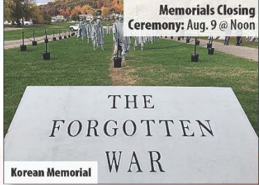
Memorials Closing Ceremony: Aug. 9 @ Noon